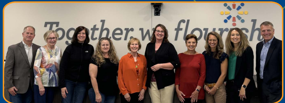
Members of the Salmon Foundation staff and Board of Directors (above) believe in helping people help themselves and working with partners like FVTC Foundation.