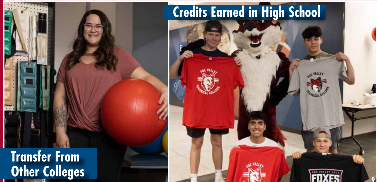
Transfer From Other Colleges