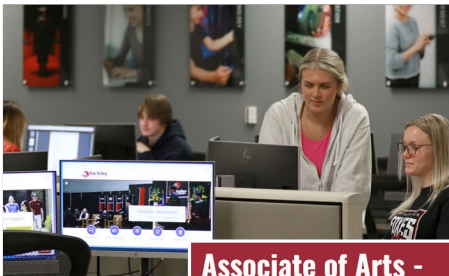
Associate of Arts - University Transfer

Fox Valley Technical College is highly responsive to industry changes by continually adding new programs that align with the evolving needs of employers and the community. As a technical college, we possess the agility to promptly adapt and introduce programs that equip individuals with the latest skills. Below are a few examples of programs we've recently added to our lineup of more than 250 programs.