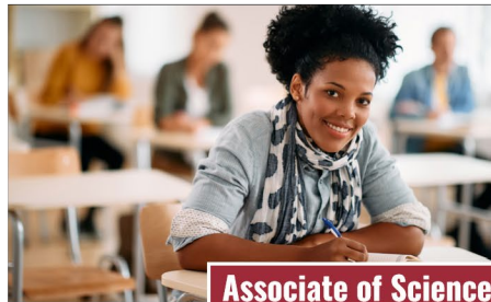
Associate of Science - University Transfer