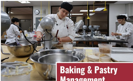
Baking & Pastry Management