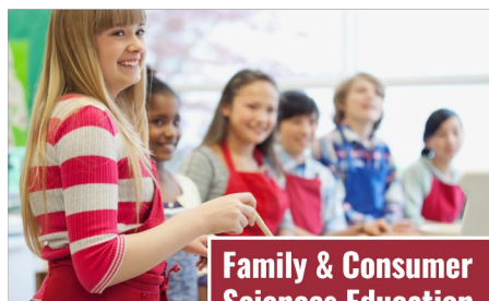
Family & Consumer Sciences Education Instruction